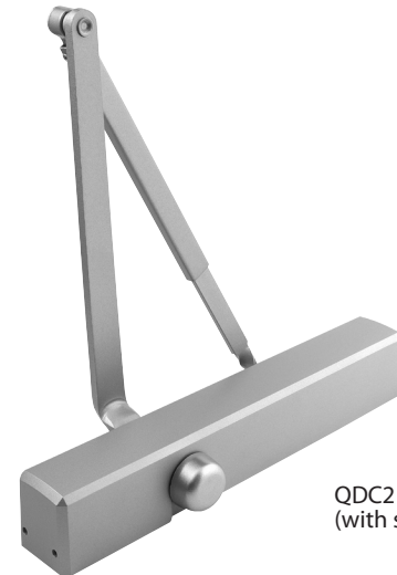
QDC211 (with standard slim-line cover)